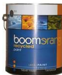
plastic paint cans