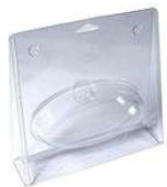
Moulded retail Packaging or non-medical blister pack (boxboard & paper removed)